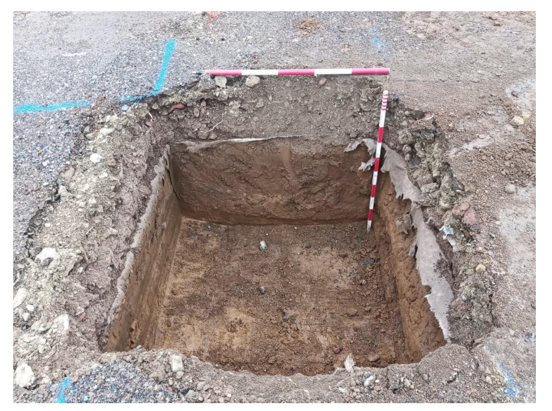
Plate 5. Foundation section