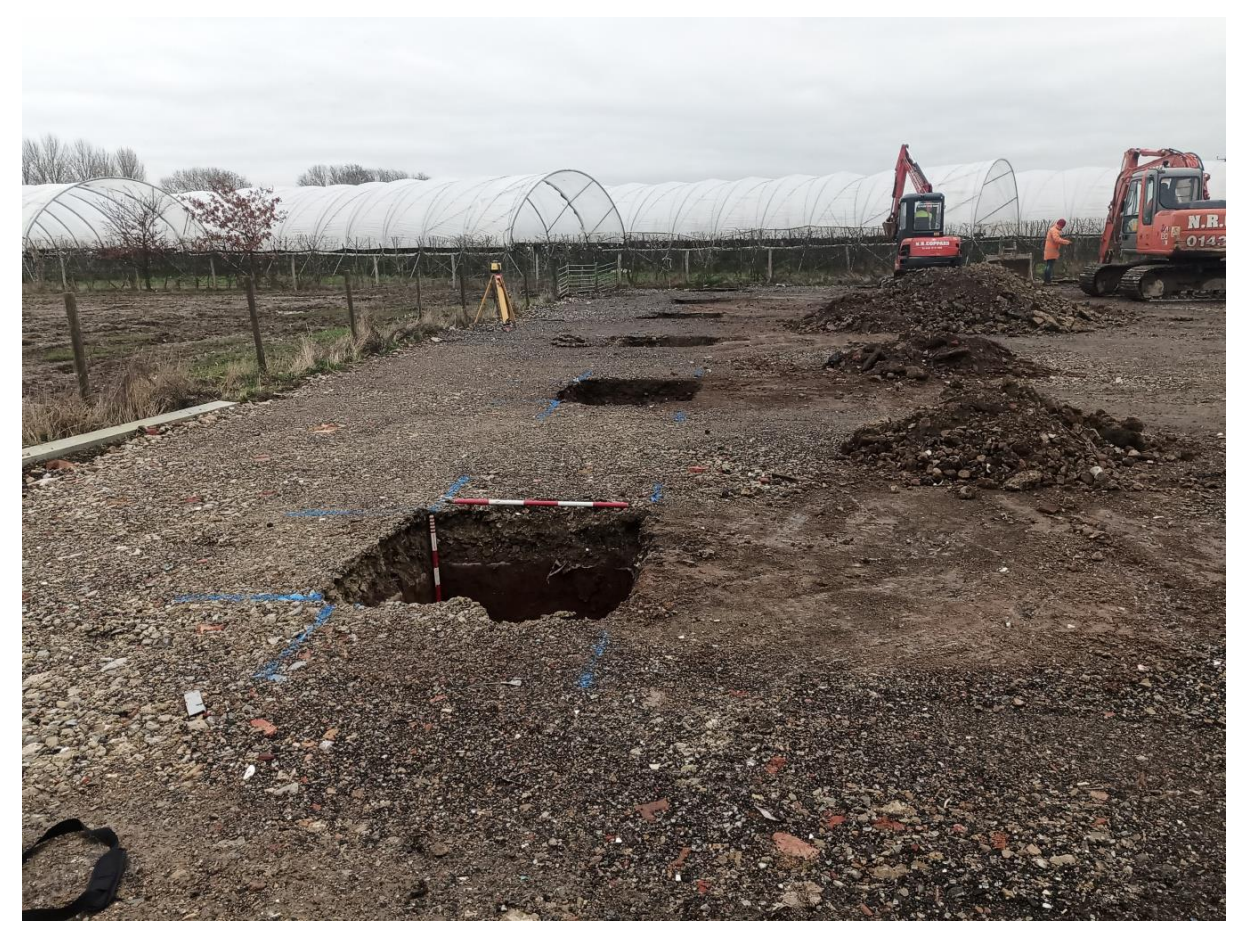
Plate 1. Foundation footings (looking North)