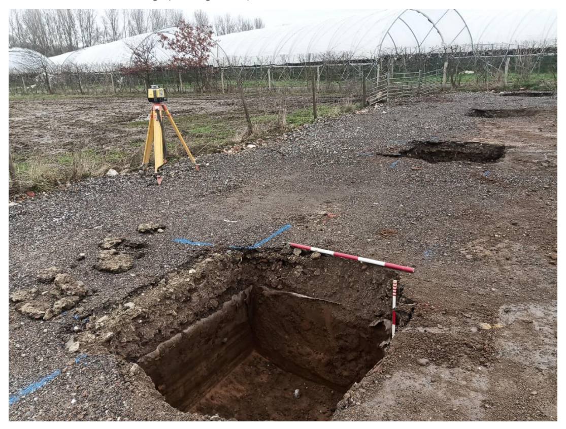
Plate 3. Foundation footing (looking NWW)