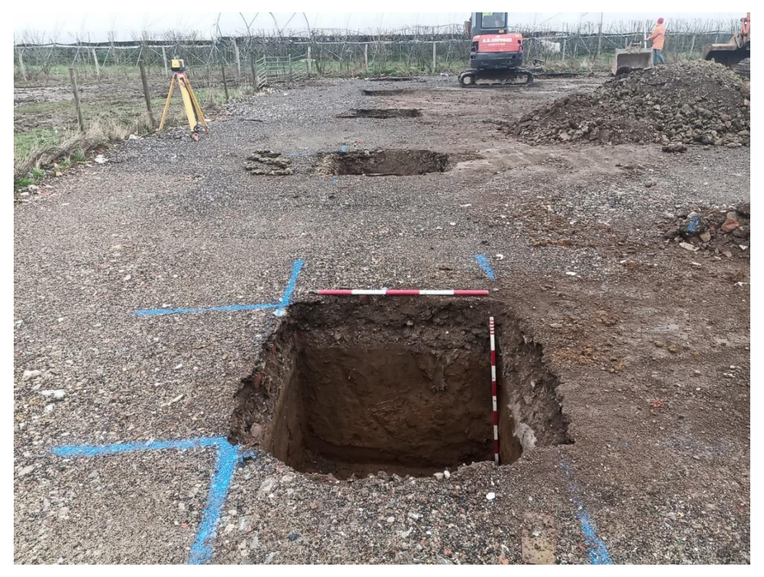
Plate 2. Foundation footings (looking North)