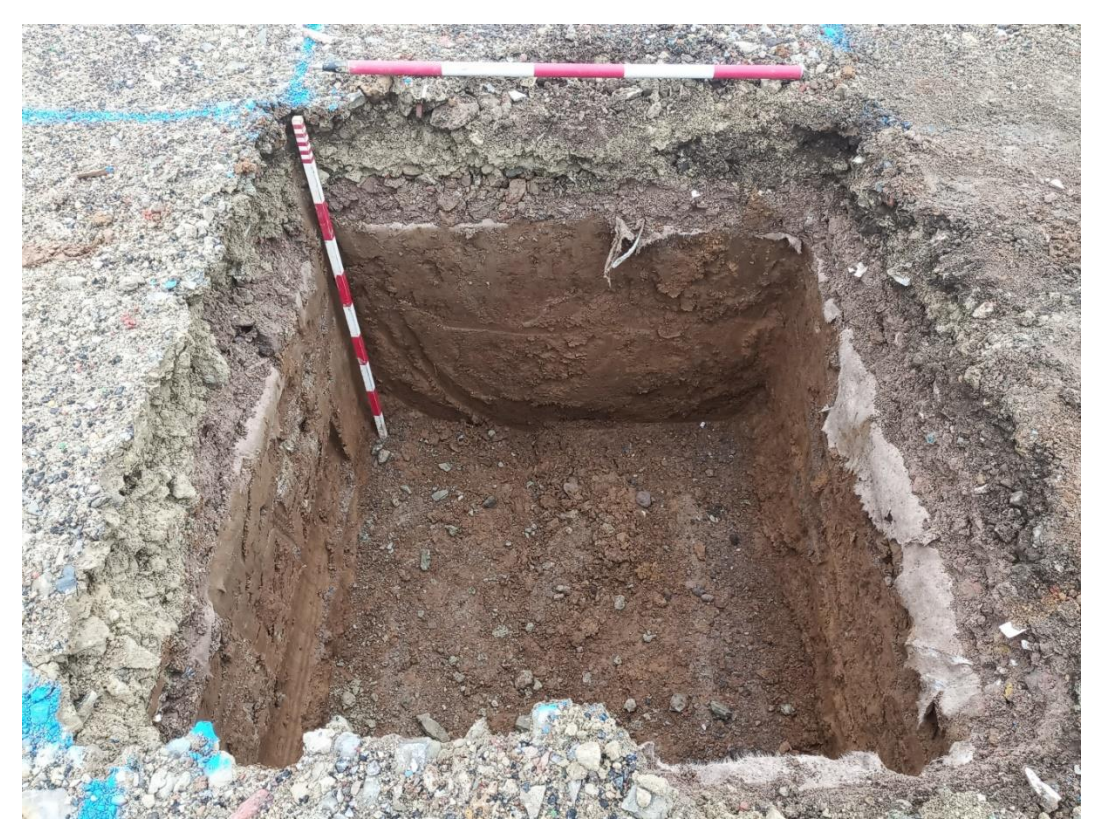
Plate 4. Foundation footing